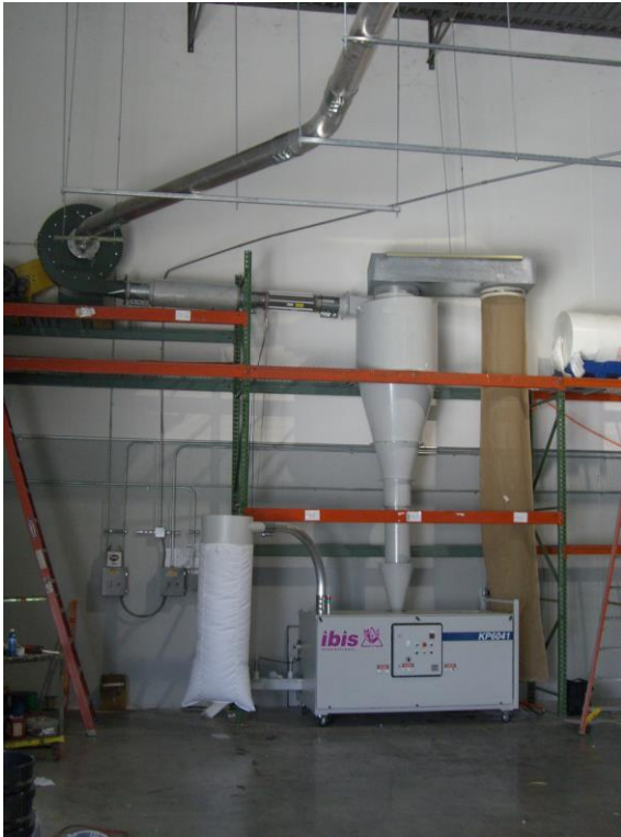
KP6041 with Cyclone Receiver